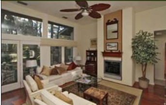
Lawton Villas - Walk to Beach 2 BR, 2 BA $424,000