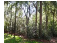
Wexford Marsh Vws $75,000