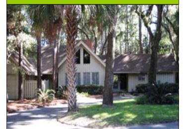
Greenwood Forest 3BR, 3BA $619,500 Furn