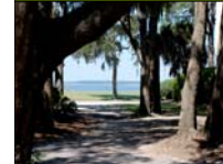
Sea Pines Harbour Town $599,000