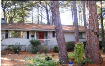
6th row from Beach. 3 BR, 3 BA $499,000