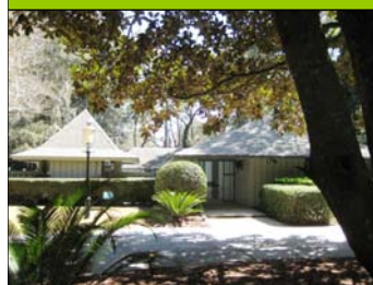
Greenwood Dr. Lagoon & golf views 4 BR, 4 BA $759,000