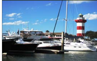
Harbour Town - 50 foot slip $250,000