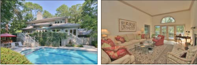
Wren Drive - 3 BR, 3.5 BA plus Den $1,295,000