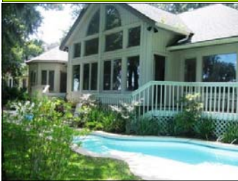
Heath Dr - 4 BR, 3 BA w/ golf views $799,000 furn