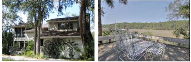
Stoney Creek - 3 BR, 2.5 BA plus office $995,000