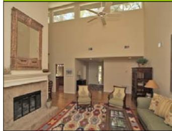
Deer Run Lane - Minutes to beach. 4 BR, 4 BA $759,000