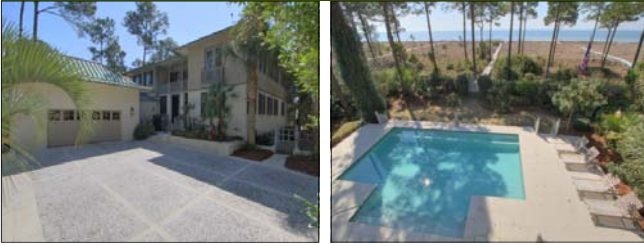
Belted Kingfisher - 5 BR, 4BA, 2 HBA $6,750,000